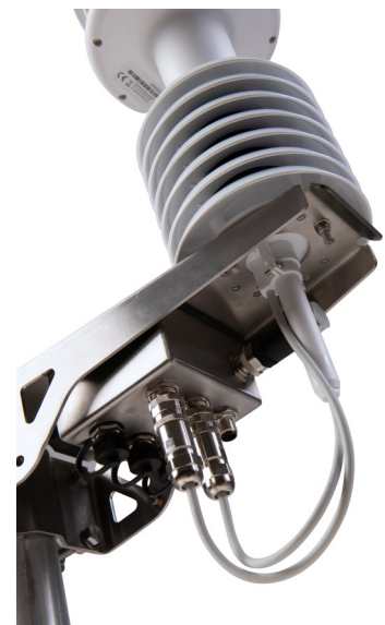
MetConnect connectors allow expansion and provide high IP rating