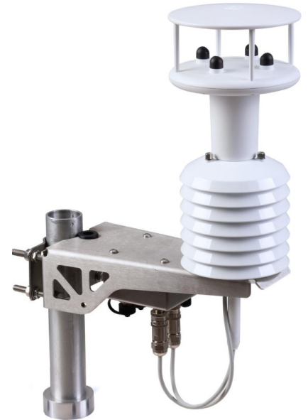
MetConnect One compact model with integrated wind sensor